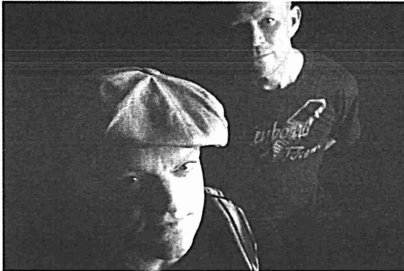
Erasure's Andy Bell (front) and Vince Clarke.

Feel in the mood to reminiscence with Erasure ? Run out and buy the group's four-disc box set, "Total Pop!—Deluxe Box," or a digital-only release of "Pop! Remixed" to be released Tuesday, April 7. For more information, visit www.rhino.com . For more about Andy Bell, visit www.AndyBell.com .